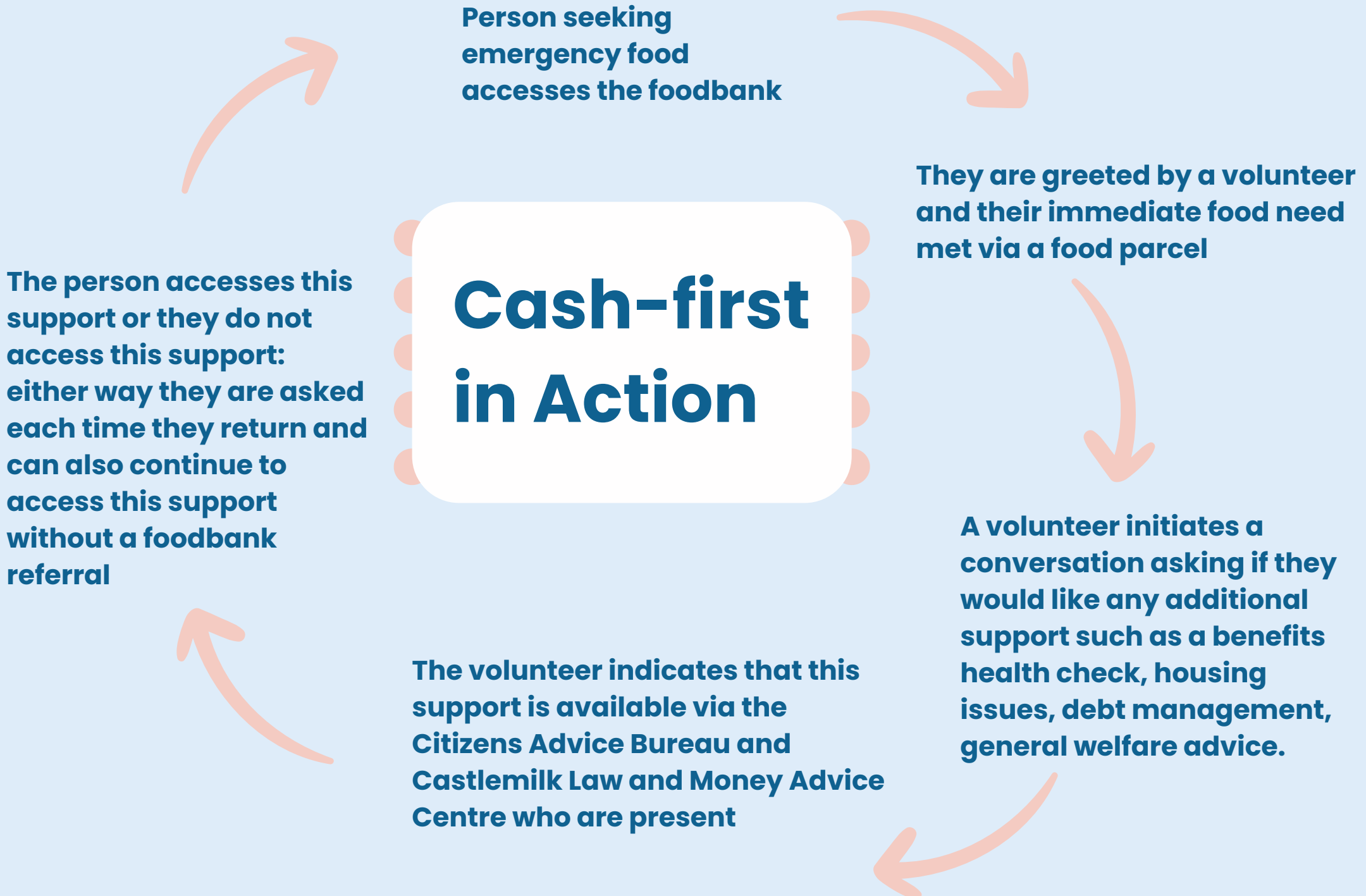
Figure 1: GSE Foodbank Cash-first in Action