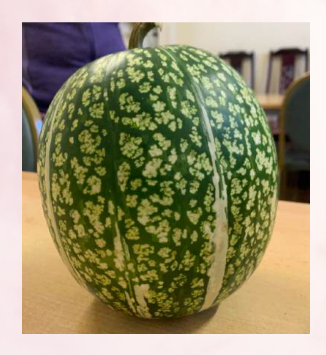
Shark fin Melon