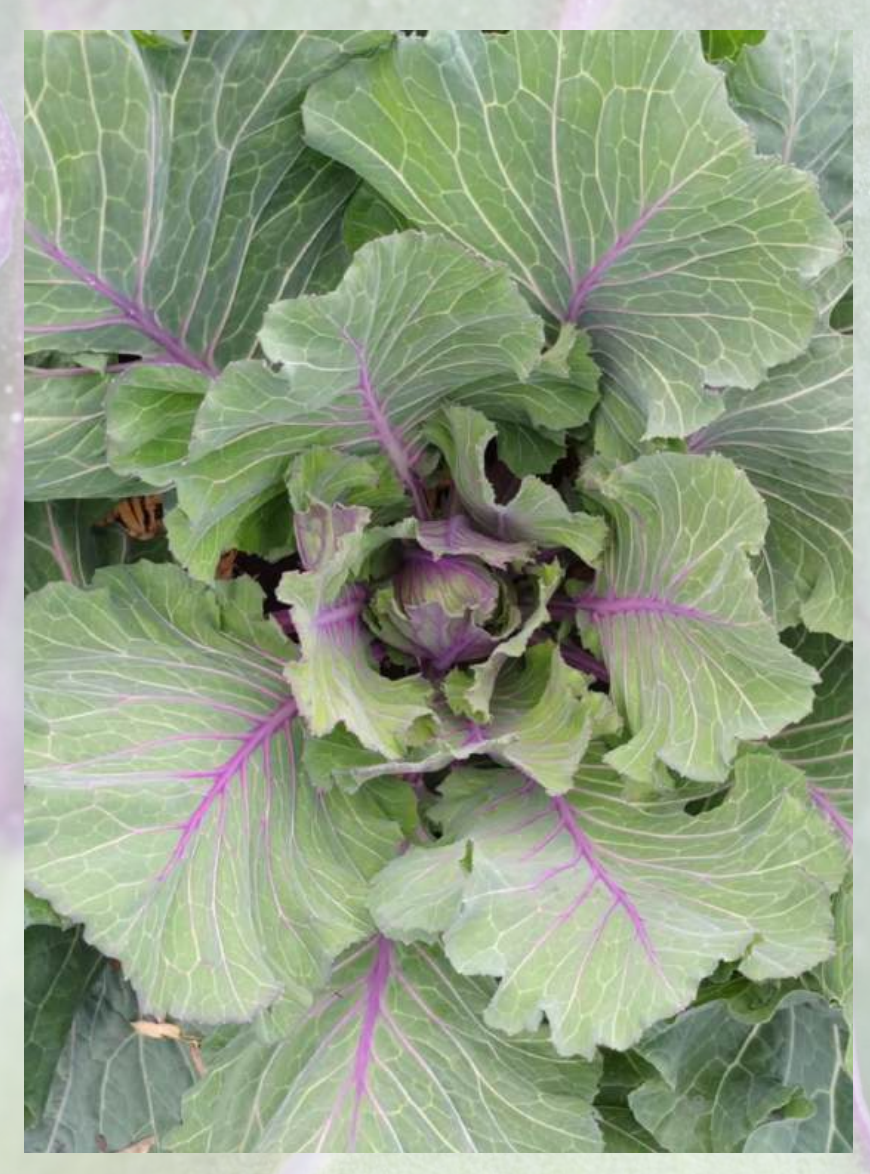
possibly dates back to Viking times or earlier.

'Auld Maunsie biggit him a Cro Ta grow him kale fir mutton bro Fir Maunsie never tocht him hale, Withoot sheeps shanks an kogs o'kale'