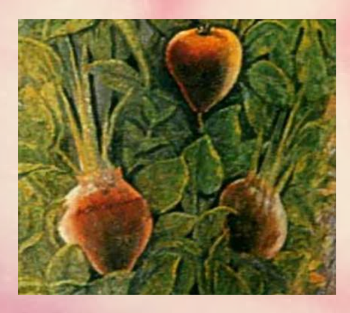
Two images of table beet with spherical roots from the festoons painted by Giovanni Martini da Udine incorporated in the Cupid and Psyche frescos of Raphael Sanzio, 1517, in the Villa Farnesina, Rome.